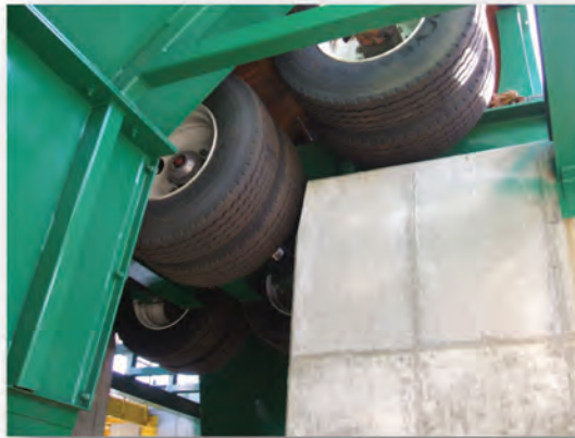
Drum shell is driven by rubber tires.